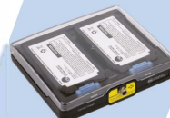
Dual Battery Charger